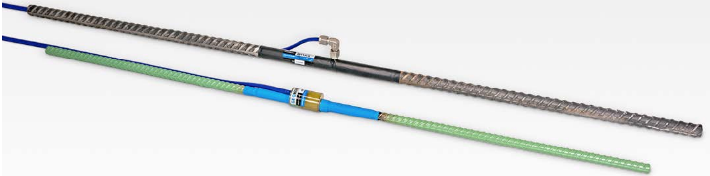
Model 4911 "Sister Bar" (front) and the Model 4911A Rebar Strainmeter (rear)