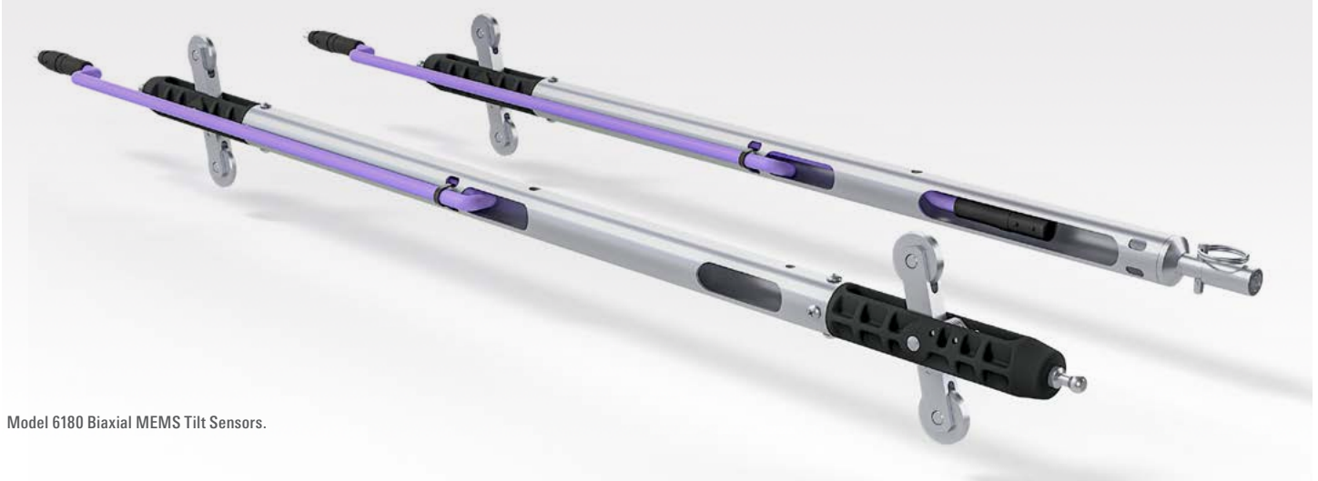
Model 6180 Biaxial MEMS Tilt Sensors.