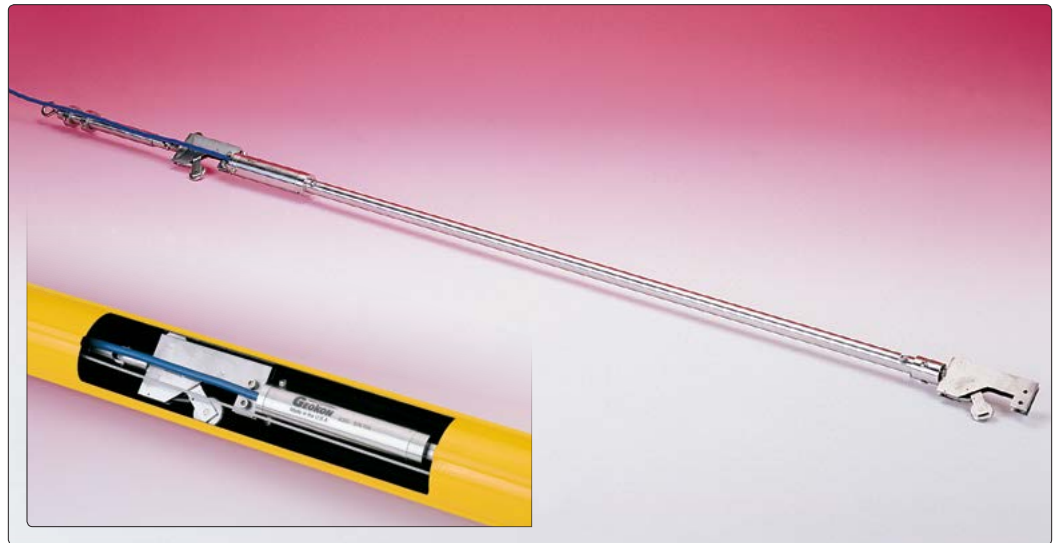
• Model 6300 VW In-Place Incliner. Inset photo reveals installation detail with section of Model 6500 Incliner Casing removed.