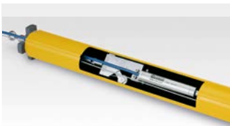
Installation detail with section of Model 6500 Inclinometer Casing removed.