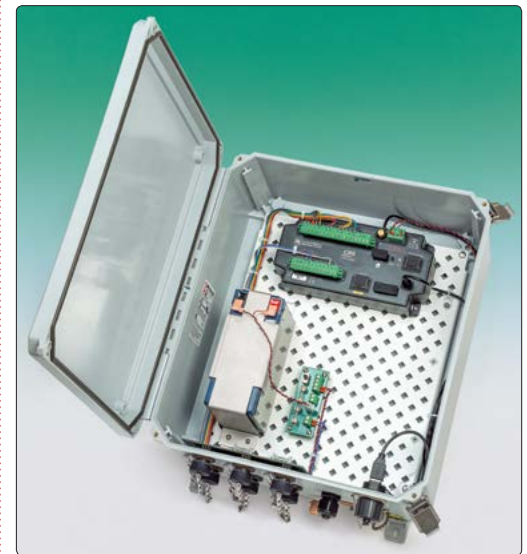
● Model 8600-1 Datalogger.