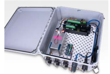
Model 8600-1 Datalogger.

(Campbell Scientific CR1000, Data Electronics Datataker 600, Geomation Model 2380, etc.). Other dataloggers can be accommodated using the GEOKON Single Coil Autoresonant Adapter (SCA).