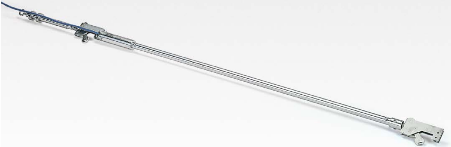
Model 6300 VW In-Place Inclinometer.