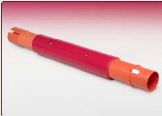
• Model 6400 telescoping coupling.