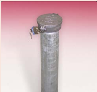
• Model 6501-6-2 Inclinometer Casing Protective Housing, 4" galvanized steel pipe with lockable cap.