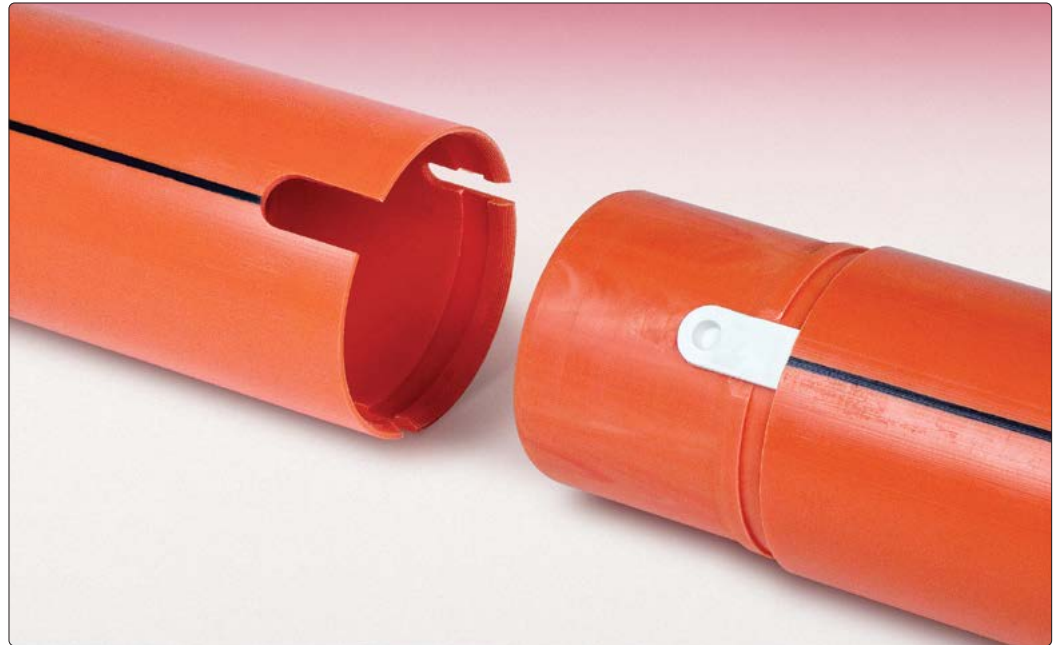
• Close-up shows the Glue-Snap sections of the Model 6400.