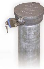
Model 6501-6-4: Casing Protective Housing