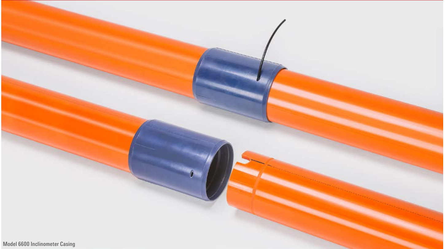
Model 6600 Incliner Casing