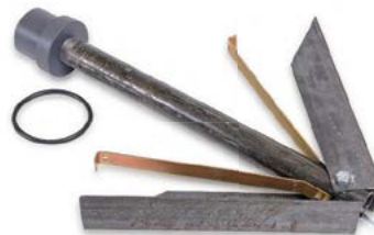
Model 6600-2A: Casing Anchor