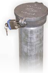
Model 6501-6-4: Casing Protective Housing