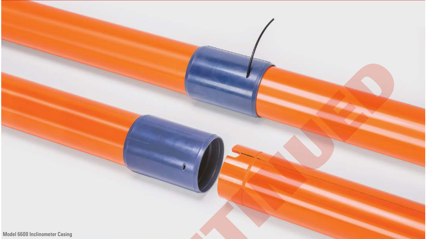
Model 6600 Inclinator Casing