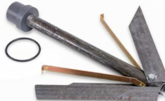
Model 6600-2A: Casing Anchor