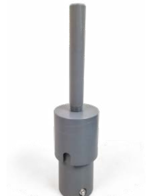
Model 6600-2RT: Reconnect Alignment Tool