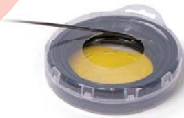
Model 6600-2: Quick-Lock Coupling Wire