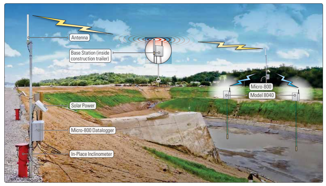
An example of a Model 8025 Micro-800 and Model 8040 Wireless Multiplexer network installation.