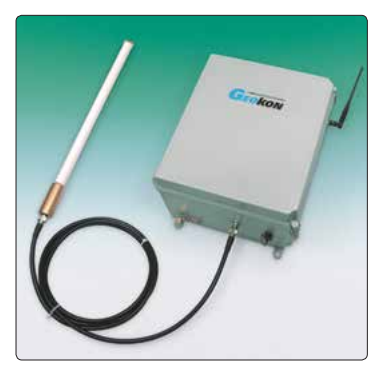
Remote datalogger base station (or hub) with cellular whip antenna for PC COMMS and high gain OMNI radio antenna for Model 8040 wireless nodes.