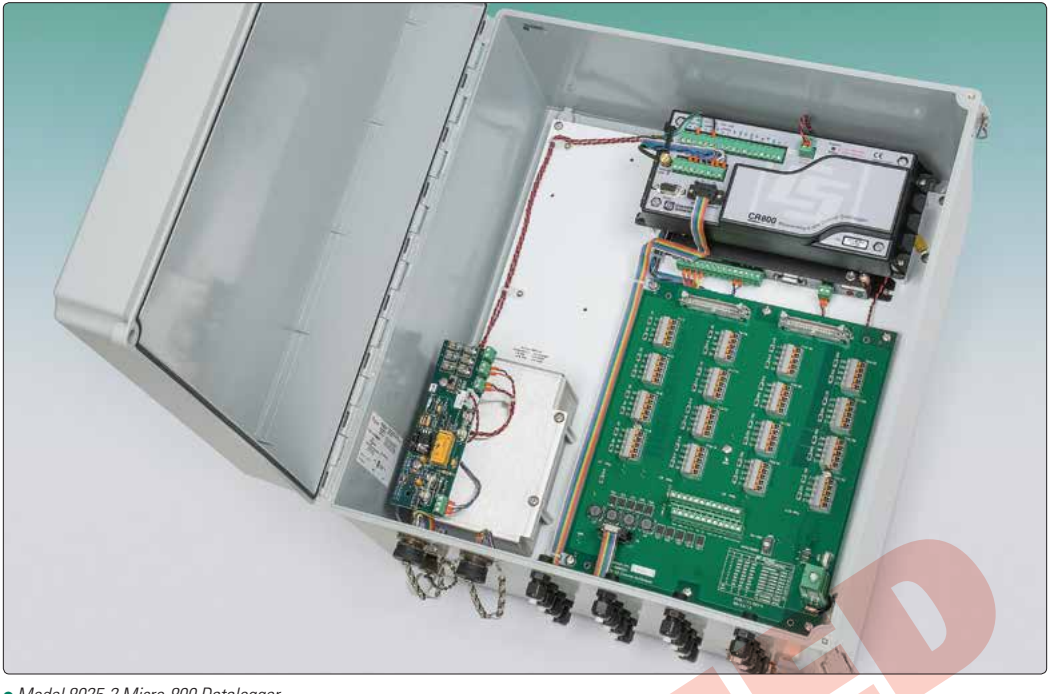
Model 8025-2 Micro-800 Datalogger.