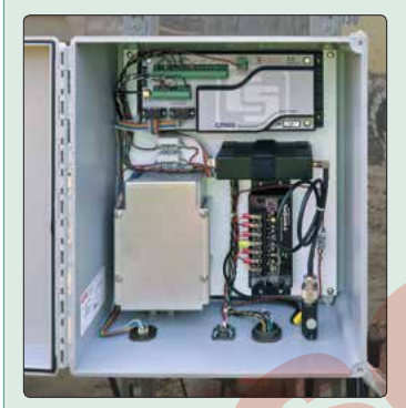
Model 8025 Micro-800 with radio modem (configured for a Model 6150 MEMS In-Place Inclinometer).