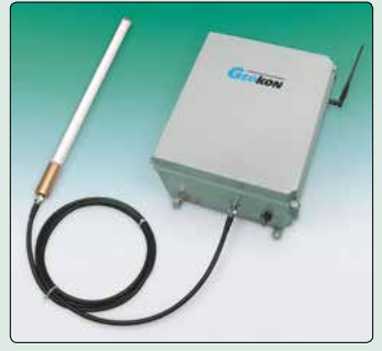
Remote datalogger base station (or hub) with receiving and transmitting antennae.