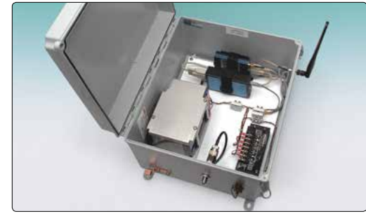
Remote datalogger base station (or hub) internal details.

For most applications the 8026 is generally used with a manhole type lid antenna which allows for installations in roads, runways or other situations where a flush-mounted system is required. (Where flush mounting is not required, a conventional Omni or Yagi antenna can be used.)