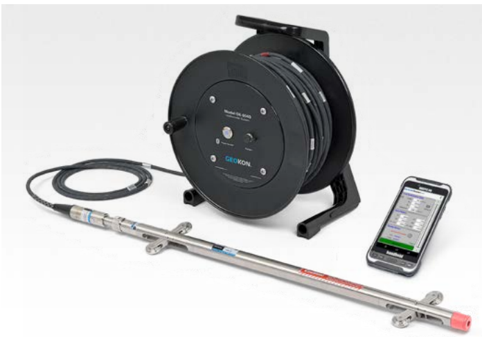
Model FPC-3 shown with the Model GK-604D Digital Inclinometer System.