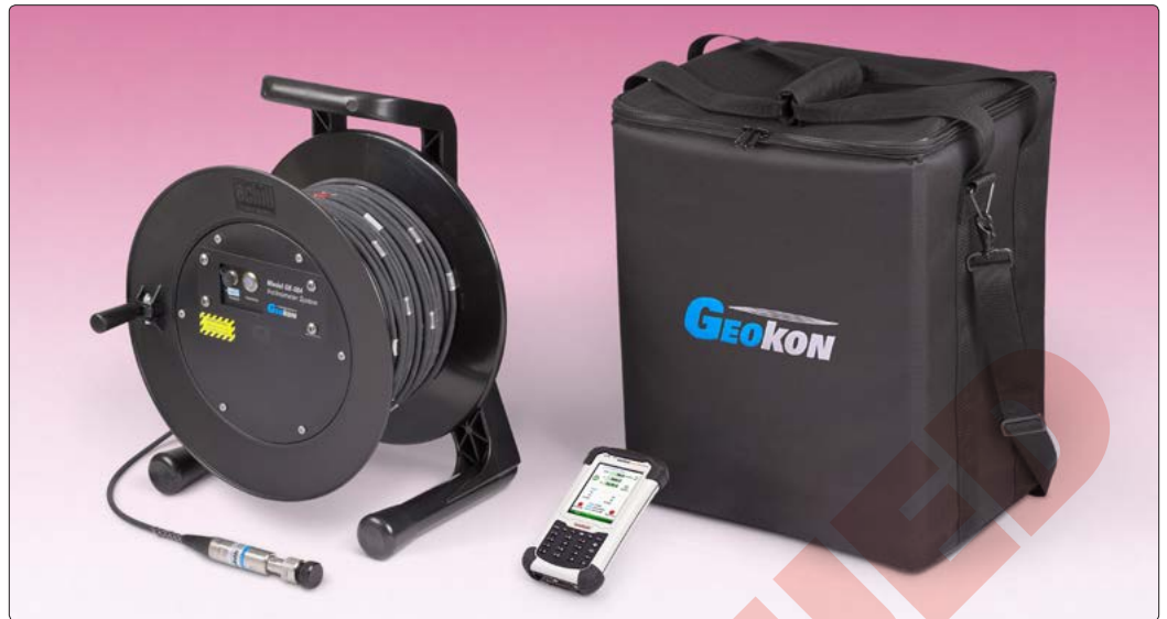
• Model GK-604 Inclinometer Readout comprising cable reel with probe interface, cable, Field PC and carry case.