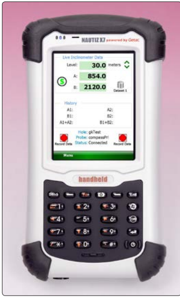
● Model FPC-1 Field PC showing an inclinometer data reading screen shot.