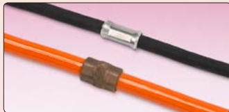
• Model 6000-2 Control Cable (top) and Model 6000-4 Inclinometer Cable (bottom).