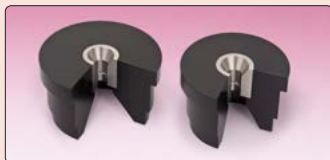
• Model 6000-14 (left) and Model 6000-13 (right) Cable Holds.