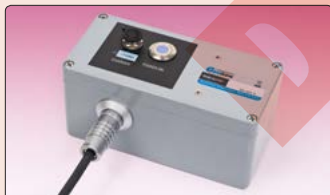
• Model GK-604-4 Interface.