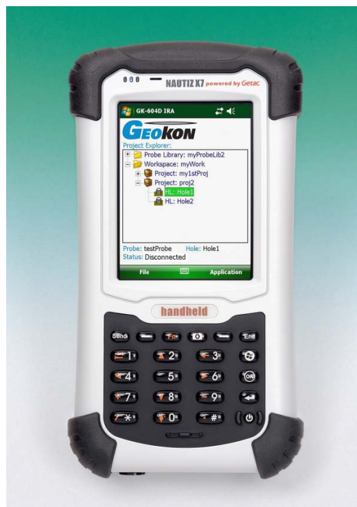
Figure 2 – The FPC-1 Handheld Readout