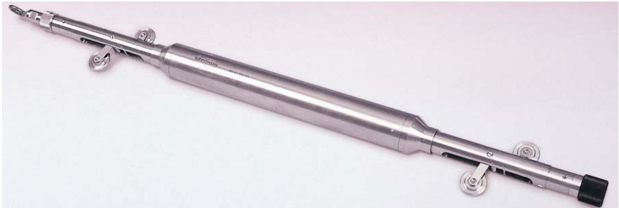
Figure 1 - Horizontal Inclinometer Probe

Figure 1 shows the horizontal inclinometer probe. The probe is designed to be used in conjunction with a special cable connected to a readout box and to be used with grooved inclinometer casing. This manual describes the use and maintenance of the inclinometer probe and cable. Further details of the operation of the FPC-1 readout box (Figure 2), are to be found in the GK-604D manual; and for installation of the inclinometer casing in the Model 6500 installation manual.