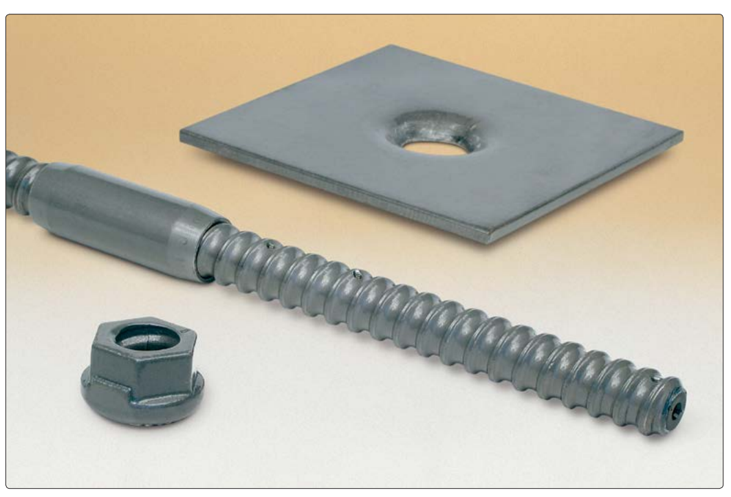
• Model 4910 Instrumented Rockbolt components (front to back: nut, rockbolt and mounting plate).