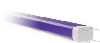
5 Distributed Fiber Optic 3D Sensor