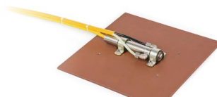
6 VW Settlement System