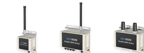
9 GeoNet Wireless LoRa® Data Loggers, Data Acquisition System