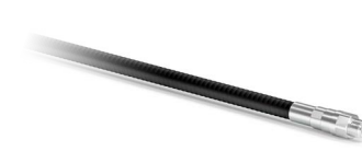
7 Time Domain Reflectometry Cable